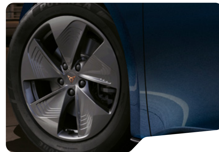
↑ 18" CYCLONE □

Our global range of cars and product specifications varies from country to country. Please, visit your local CUPRA website to know more about the product offer available for you.