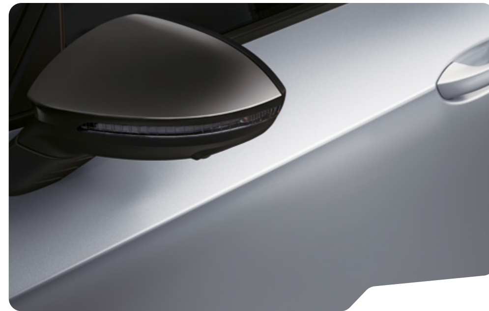
↓ GLACIAL WHITE 2