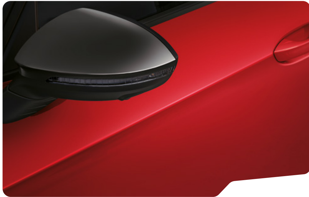
↓ RAYLEIGH RED 2