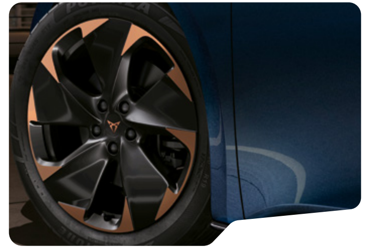
→ 19" COPPER TYPHOON □