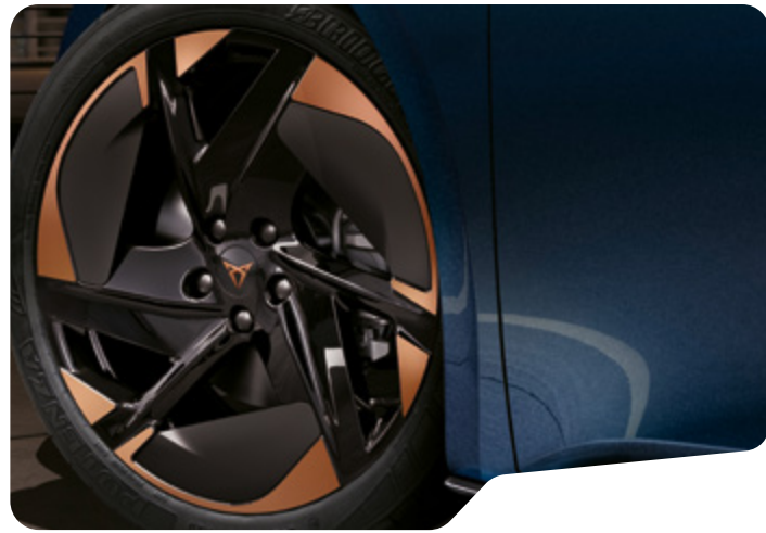
→ 20" BLIZZARD □